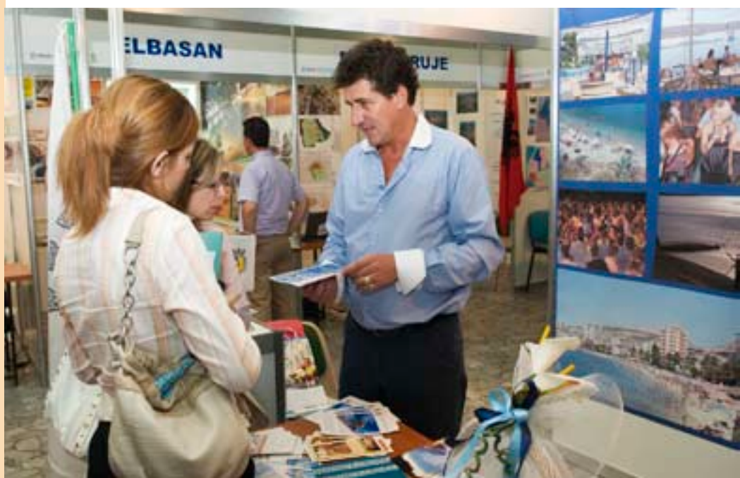
Photo: Innovative Techniques Lead to Better Services - Municipalities Exhibit their Achievements