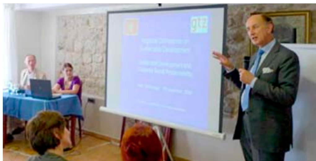
Photo: Regional Conference on Sustainable Development-Institutional challenges and implementation

The Regional Conference entitled Sustainable Development - Institutional Challenges and implementation took place in Kotor, Montenegro from 24 to 25 September 2009. Organized by Department of Sustainable Development in the Council of Minister in Montenegro and the Office of German Co-operation, GTZ, the event brought together government officials from Balkan countries. The aim was to create a debate on the components of sustainable development as well