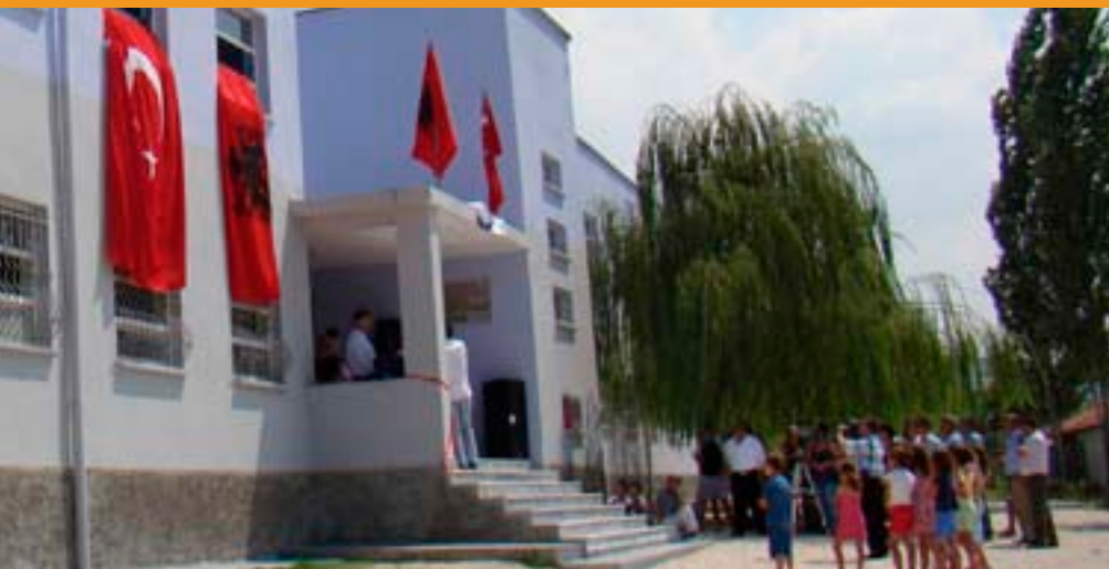
Photo: Inauguration of the new school in Roshnik village in Berat, funded from the Government of Turkey